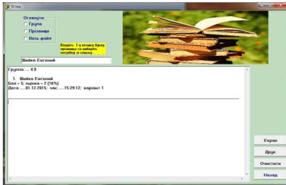
Figure 2. Test results window

The control component is displayed as a computer test presented by three equivalent 30-item tasks. As the test is completed, the program provides information about the number of correct answers and grades (Figure 2).